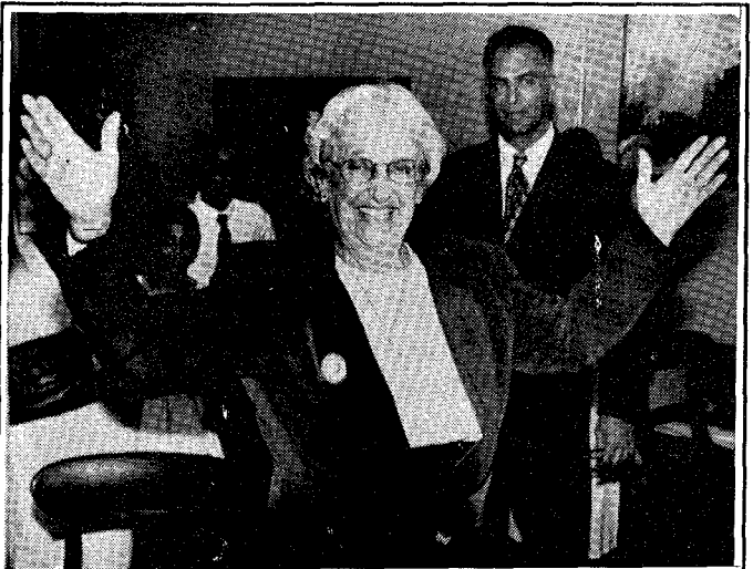
"The People have won... Guyana has won!"