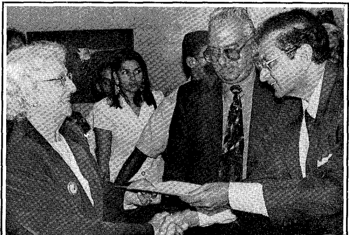
Her Excellency Janet Jagan, OE, was sworn-in as Guyana's first woman President on Friday, December 19, 1997.